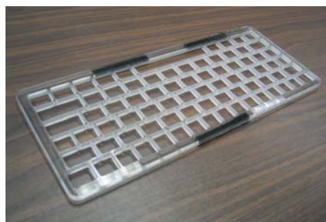
Keyguard and Keyboard Glove for Polyana 3 are shown

333-5092-00 Keyguard, Acrylic ..... $195.