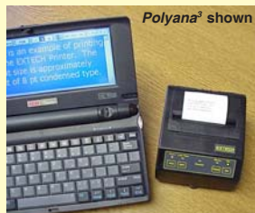
Polyana 3 shown

The Polyana can use its serial connection to print to serial input printers. However, because the unit is intended for users who may eventually use scanning approaches that will occupy the serial port, Polyana 's IRDA (infrared) port is a more appropriate option. Persona has been designed to access the EXTECH portable printer by infrared.