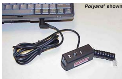
Polyana 3 shown