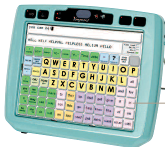
WordCore for Vanguard

PRC has partnered with Madentec, a leader in headpointing systems, to introduce the first integrated headpointing solution. When you select the headpointing version of the Vanguard, the Madentec Tracker headpointing system is included in the device. With this built-in access option, the client needs only a reflective dot to access the Vanguard. For clients who use headpointing access, this innovation provides both savings and convenience of setup and operation.