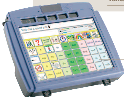
WordPower for Vantage