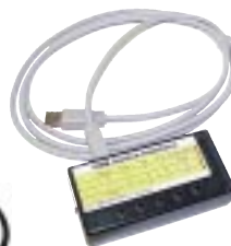
USB Switch Interface